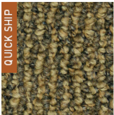
RHR01 News Radio