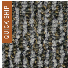
RHR03 Limited Ac...