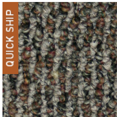
RHR02 Mass Tran...