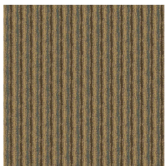
JRN25 Lock & Key