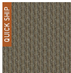
JRN55 Silver Clip