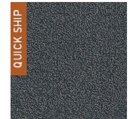
2653 Blue Streak